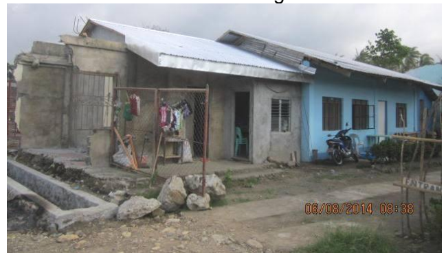
....now has a new roof. Campus front wall to be replaced later.