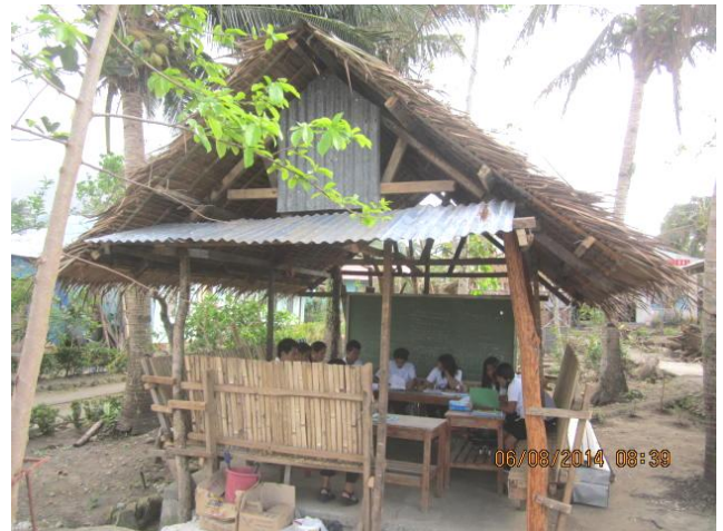
...has been rebuilt and is being used for classes.