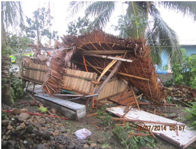
The collapsed EBI cottage...

Jesus says in John 16:33b: "In this world you will have trouble. But take heart! I have overcome the world." Despite PAMI getting hit hard by Typhoon Glenda on July 15th, the gates of hell shall not prevail (Matt 16:18). Through God's strength and provision, recovery is underway and ministry continues. Fifteen souls were baptized in Bulan on August 2nd! (see below) Even though EBI is still without electricity (meter to be fixed soon), classes and church services are ongoing. Thank you to all those who've been praying and giving so generously. It's so encouraging to see an amazing $7250 of typhoon relief donations come in the last 3 weeks. This is more than enough to cover $4000 needed to repair PAMI facilities (including $2000 Emmaus Bible Institute buildings, $400 EBI rain damaged laptop, $240 Bulabog church, $400 Castilla church & parsonage, $700 Irosin church, $250 Barcelona church, $10 Bulusan church). The balance will be used to assist needy church members to repair their homes. Thankfully, Compassion is going to help repair homes of Compassion sponsored families living near EBI (28 totally collapsed, 97 partial damage). PAMI will help at least 25 other needy families with totally collapsed houses.