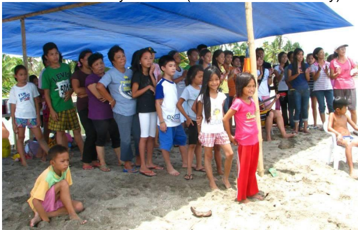
15 were baptized on Aug. 2nd near Bulan (5 from the main Bulan church, 4 from MonteCal church, 6 from Togbongon outreach).