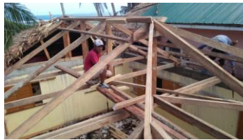
Candumaay Matnog Church before and after reroofing, replacing a woven roof with stronger corrugated steel.