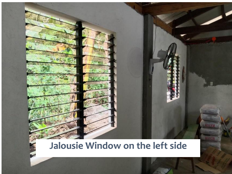
Jalousie Window on the left side