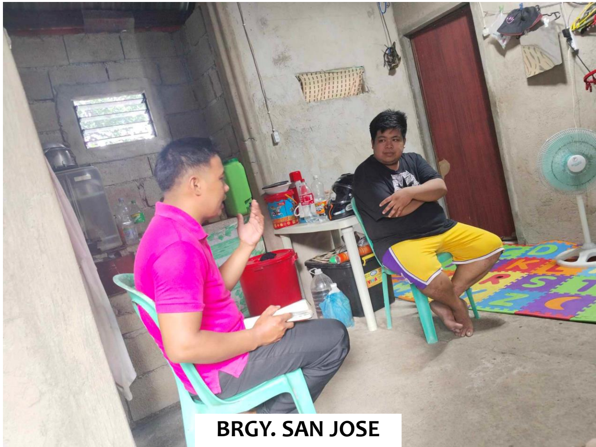
BRGY. SAN JOSE UPPER BIBLE STUDY at Gerald's household