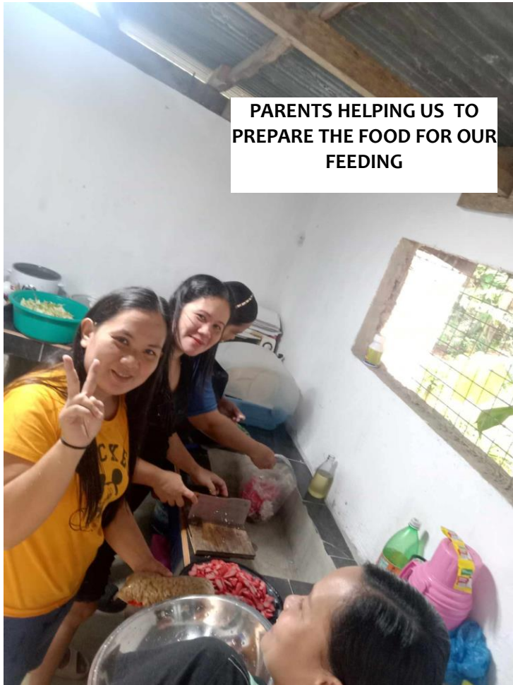
PARENTS HELPING US TO PREPARE THE FOOD FOR OUR FEEDING

BULUSAN CHURCH IS ACTIVELY CONDUCTING THE FEEDING PROGRAM IN A REGULAR BASIS TWICE A MONTH IN AN ISOLATED AREA IN SAN JOSE ELEMENTARY SCHOOL WITH 56 KIDS