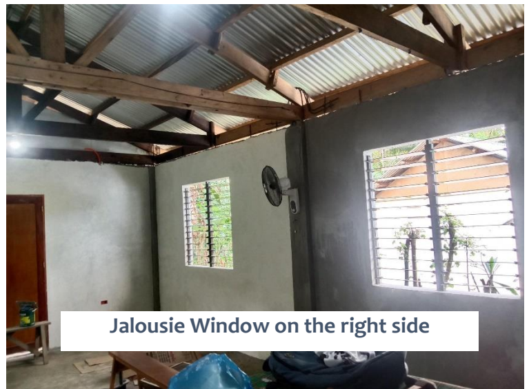
Jalousie Window on the right side