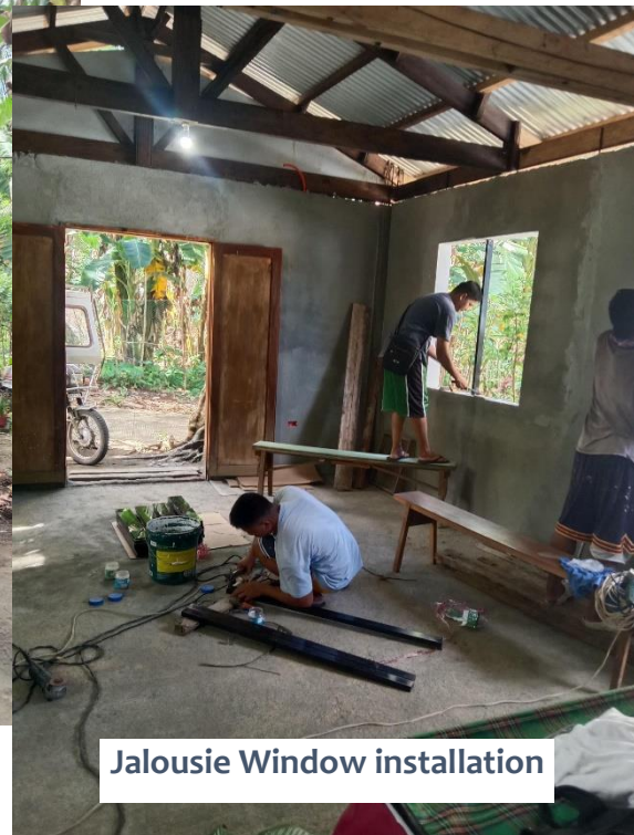
Jalousie Window installation