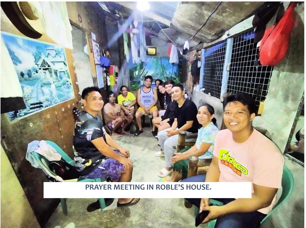
PRAYER MEETING IN ROBLE'S HOUSE.