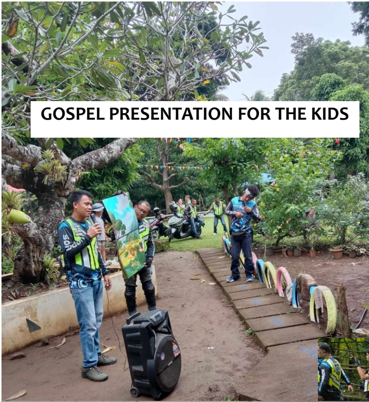
GOSPEL PRESENTATION FOR THE KIDS

BULUSAN CHRISTIAN CHURCH IN PARTNERSHIP WITH ROCK RIDERS CLUB (ROCK means Reaching Out for Christ Kingdom which most of the members are pastors from different denominations) to conduct an adopt a school program in San Jose Bulusan Sorsogon where our church is located. Thanks for the generosity of each member who volunteered their time and financial resources to make a spiritual and material impact to the lives of the children and bring them closer to the Gospel of Jesus Christ.