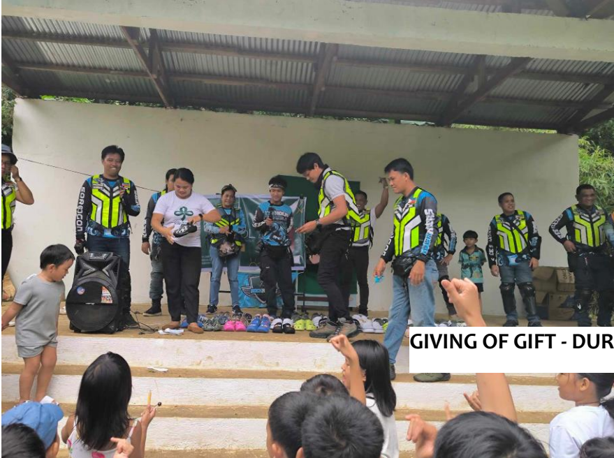
GIVING OF GIFT - DURABLE SLIPPERS