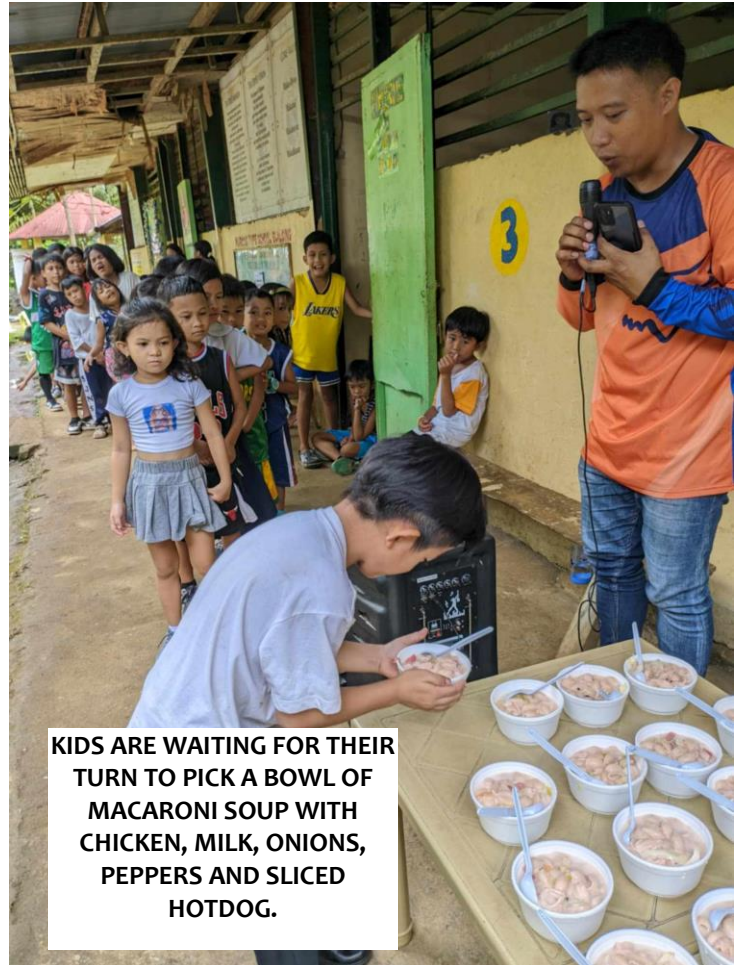
KIDS ARE WAITING FOR THEIR TURN TO PICK A BOWL OF MACARONI SOUP WITH CHICKEN, MILK, ONIONS, PEPPERS AND SLICED HOTDOG.