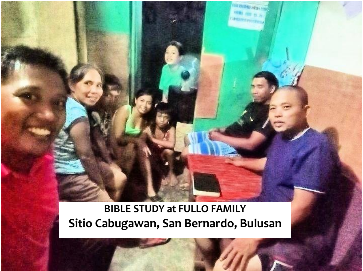
BIBLE STUDY at FULLO FAMILY Sitio Cabugawan, San Bernardo, Bulusan