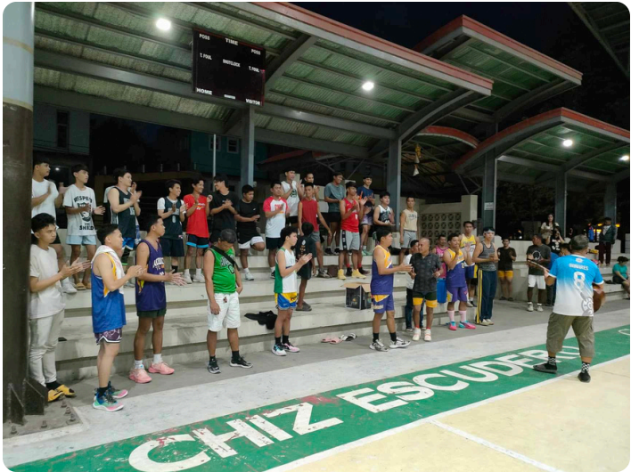
This is a new strategy for reaching the youth through basketball evangelism program together with other pastors.