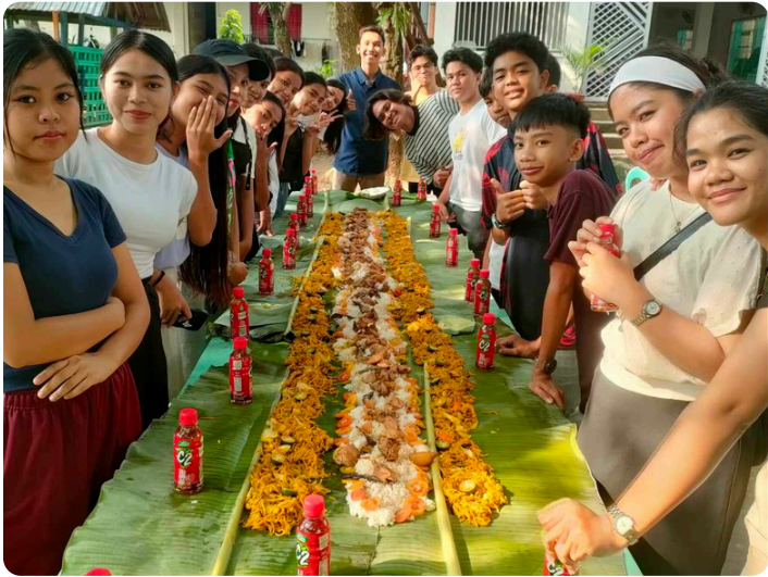
Youth gathering (some youth from bulabog and Padaba youth)