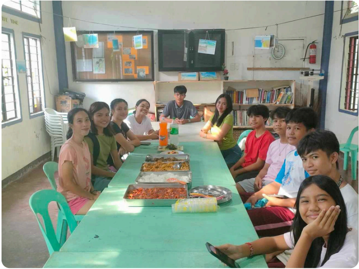
This is Padaba youth activity: home visitation, cooking lesson and gathering.