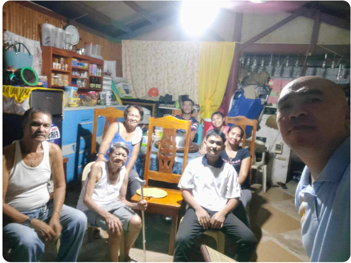
Bible study with Padaba parents and tublijon prayers meeting.