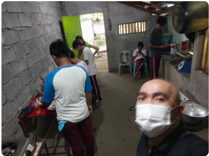
This is Padaba youth activity: home visitation, cooking lesson and gathering.