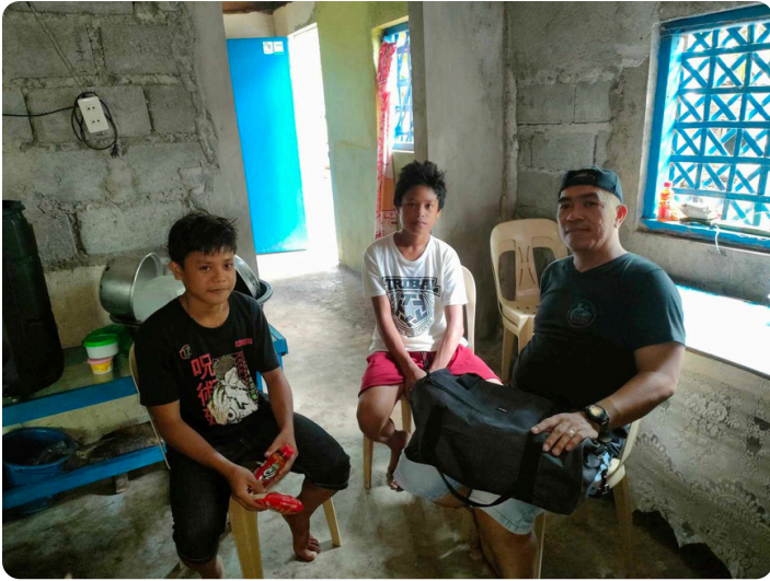
This is Padaba youth activity: home visitation, cooking lesson and gathering.