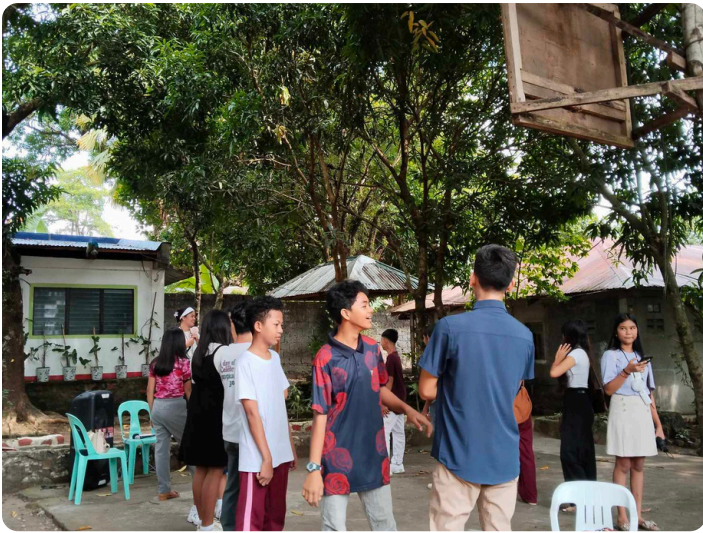
Youth gathering (some youth from bulabog and Padaba youth)