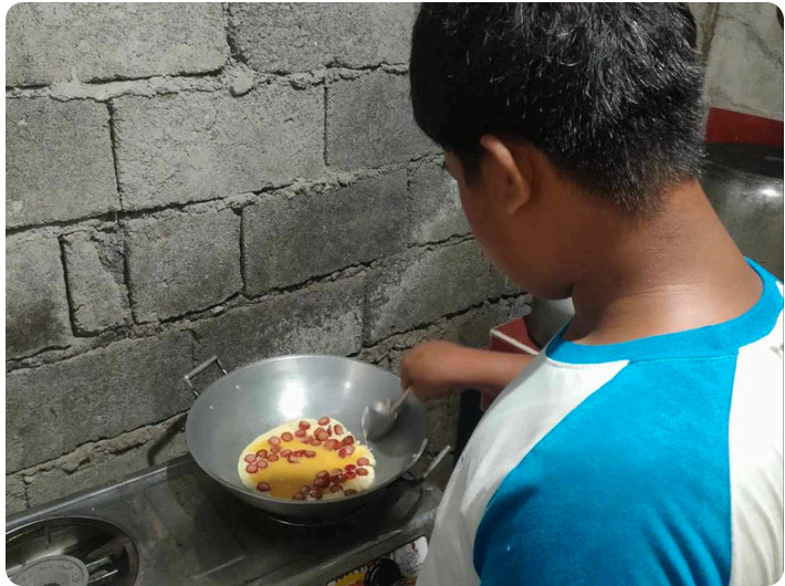
This is Padaba youth activity: home visitation, cooking lesson and gathering.