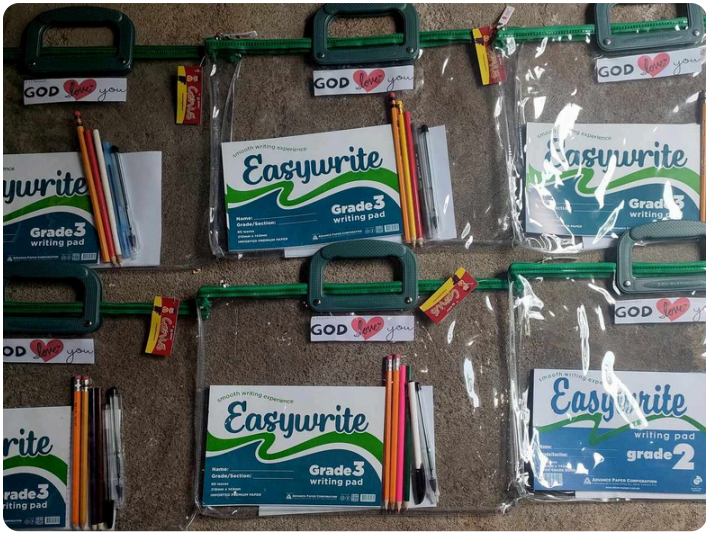
2024-2025 balik eskwela program "school supplies.Add body text