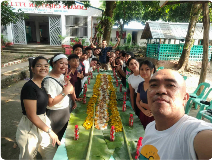
Youth gathering (some youth from bulabog and Padaba youth)