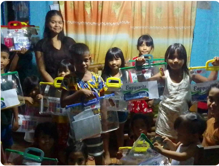
2024-2025 balik eskwela program "school supplies.