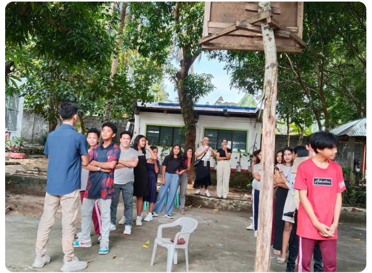
Add body text