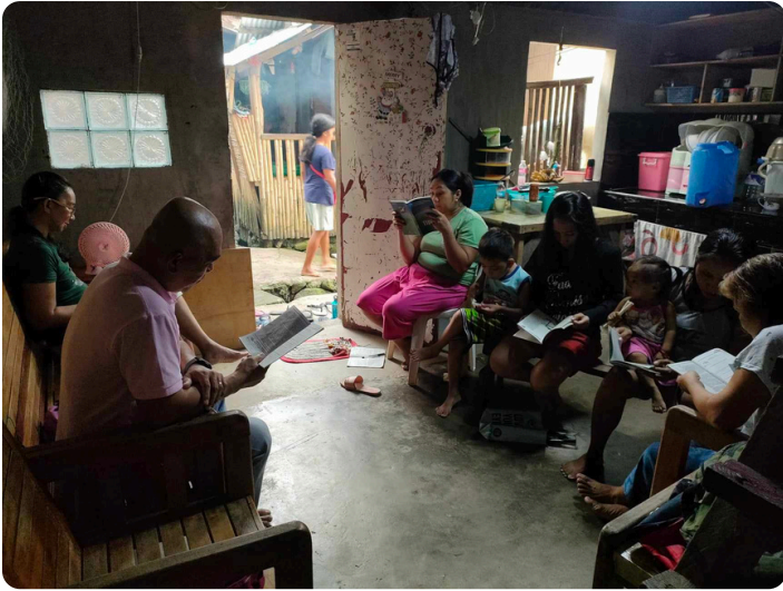
Bible study with Padaba parents and tublijon prayers meeting.