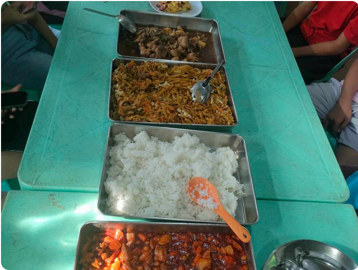
This is Padaba youth activity: home visitation, cooking lesson and gathering.