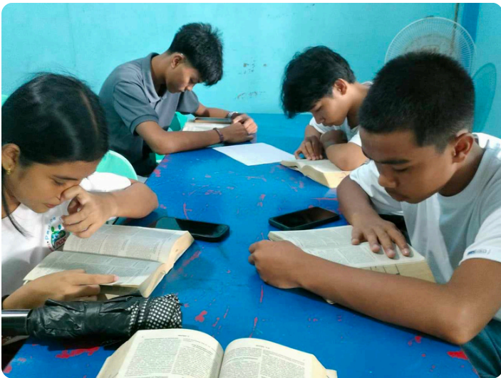
This is Padaba youth activity: home visitation, cooking lesson and gathering.