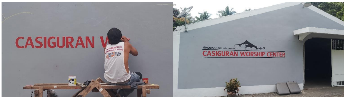
PAMI – Casiguran Worship Center

About my Midwifery journey, I can't take exam this November because the school is late in releasing TOR, maybe next year April 2024, and I will find a review center for me to review first before taking the exams.