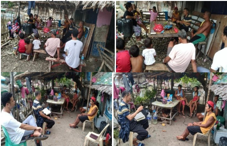
Bible study at Bucana - this is our bible study in Bukana or entrance front of Calintaan and more people are listening to the word of God here and they are interested in learning the teachings of our God that is why we continue to be happy with the people in this place