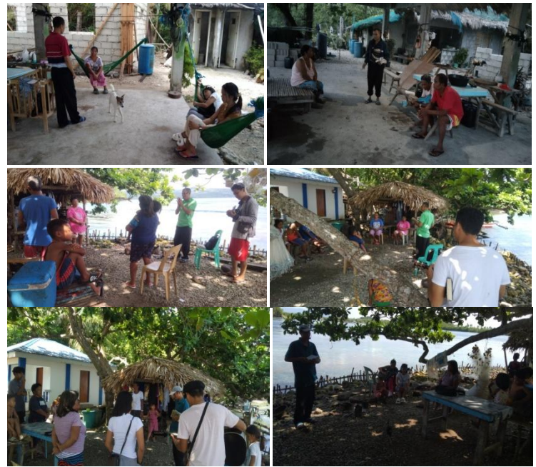
Bible at Juag - this is our bible study on the other island of Juag and here mothers mostly attend and not a single father is there. It seems that it is difficult to reach the fathers of the family with the good news of God, yet we continue to search for people to share the good news of our lord Jesus