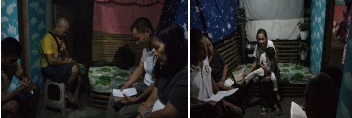
BIBLE STUDY- this is our new home bible study here in Bacolod Irosin and by the grace of our God they are attending our worship service