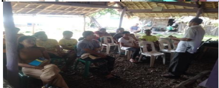
WORSHIP SERVICE - Our God is so good that he strengthens us and gives us joy in serving him and also to our brothers and sisters in Christ that although we are weak and lacking in needs at times, but we continue as missionaries we can only deliver the Great God loves those who are called for the kingdom of God. and thanks to our God for the lives of these people who, although they are poor people, continue to believe and worship our Savior Jesus