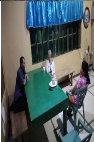
RADIO PROGRAM one night we had a visitor two women mother and daughter here they live in the relief dike Bacolod and I asked what they meant and said that she is a daughter who can be prayed over because she has a voice that she hears a lot at night she couldn't sleep well so I shared with them about Jesus who is the good news and after I preached the good news they trusted in our Lord Jesus and had a renouncing and conversion to the true God. After a day I heard that it was good. Praise God this two woman is one of the listeners of our radio program.