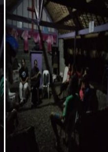
PRAYER MEETING Praise our God because our continuous prayer meetings are also having good results in the lives of our brothers and sisters in Christ, little by little there is a change in their Christian lifestyles. may they continue to grow according to the image of God