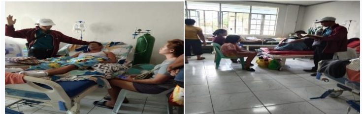
HOSPITAL MINISTRY- before our neighbor died, the family of the deceased called us to visit their loved one who had a stroke. their request that I pray over him before he died, they did not summon their priest. and when I got there I felt sorry because seeing me, it was a cry of tears not only could I hear his voice. maybe he wanted to recover and live. but God is in control of life so I told him the true and living hope that Jesus Christ died and rose again. After the altar call, I prayed over him, but after two days, he died. It's sad but thanks to Christ Jesus he is our living hope..Glory to God So let's continue to do missions that we can convey to them the good news that brings salvation while they are still alive.