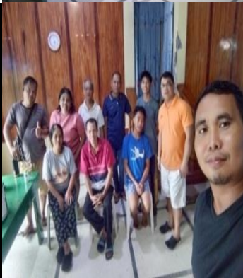
VISITORS FROM VISAYA- because of typhoon christine the pastors were stranded and had a hard time going home to the Visayas from manila and a friend of ours heard that we were here in Irosin so they searched until they found us with great joy so thank our God. Jesus' words are true seek and you will find knock and it will be opened to you. here we had a happy party and we had a prayer meeting. glory to God