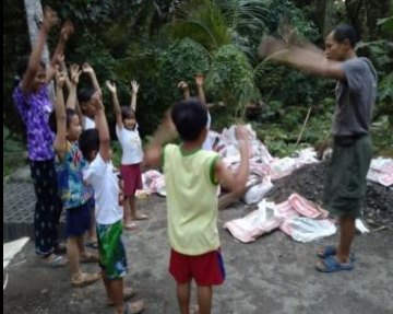
EVANGELISM Unexpectedly I visited the house of a relative of my wife and I saw these children busy on the cell phone so I called their attention for a rehearsal until I taught them the Eph. 6:1 and thanks be to our God that when they come back they make a memory verse that has action.