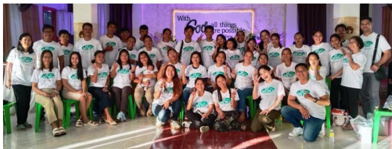
Matthew 18:14 Values Instruction Class curriculum training & orientation session at EBI on Nov 29th. We have opportunity to teach Biblical VIC in public schools.

Besides financial gifts, could use donations of used laptops, projectors, digital cameras, Christian books & CDs, school supplies, hotel sized toiletries, toothbrushes, t-shirts, baseball hats, small toys, etc. to ship in balikbayan boxes.