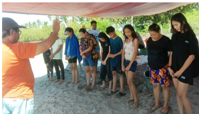
Nine were baptized in Bulan on Nov 28th

ECF church metal roof dented from a coconut tree that fell during one of the typhoons this fall. A few hundred dollars could be used to fix other damaged and leaking roofs too.