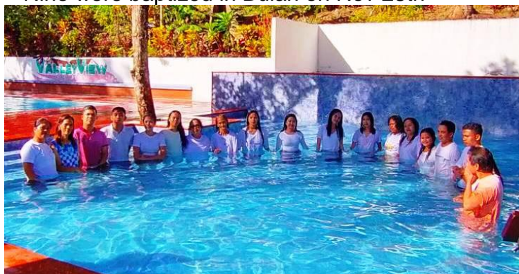
15 baptized from Emmaus Christian Fellowship on Nov 30th at Valley View Rest House