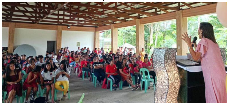
Large joint EBI partition Christmas party and fellowship on Dec 17th at Valley View Rest House, with theme "Jesus is the Reason for the Christmas Season"