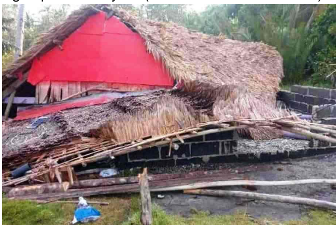
Chapel on Juag Island collapsed due to wind

Our area felt edge effects of a couple typhoons this fall, which caused a Juag Island chapel to collapse, and moderate damage to a few church roofs. We were also hit with a large government fine, affecting our budget. And some of our people have dealt with ailments or death of family. Yet in the midst of the dark days of winter, the Christmas light shines forth and brings hope and salvation. We praise God for ongoing teaching and discipling, celebrations and gift giving, and 70 believers being baptized this year (over half in the last month)!